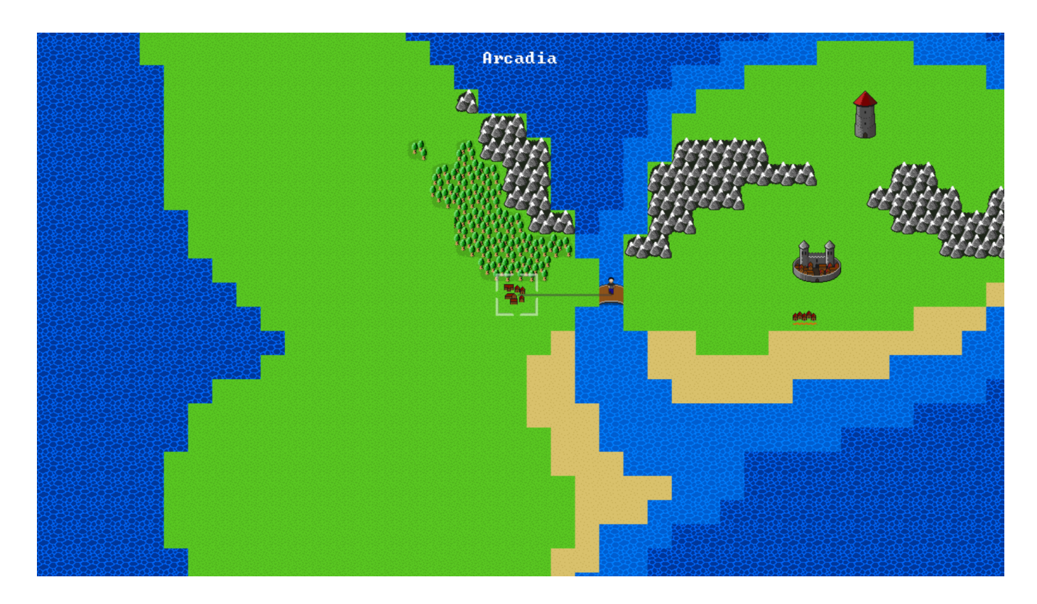
Thanks for reading!. Dream Enders received a hotfix to address bugs :

A hotfix has been pushed for Dream Enders addressing the bugs that have been revealed to me since launch. This includes dialogue errors, crashes when interacting with named N.P.C.s, and lighting issues. Please reach out if any other problems are found. Thanks, and enjoy!